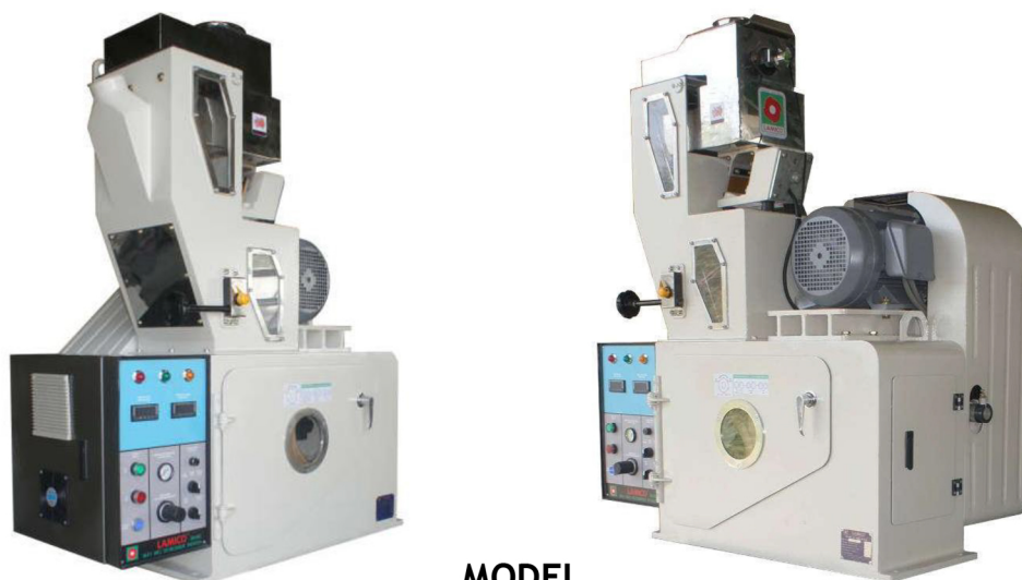
MODEL RH – Series