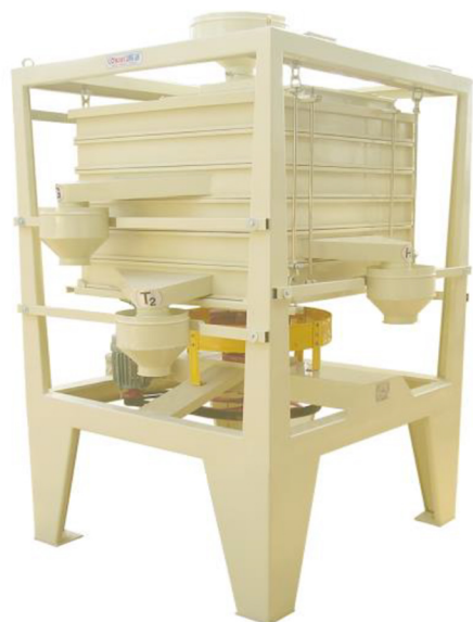
MODEL RS series